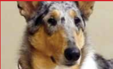
Carrie and Ava pg 10