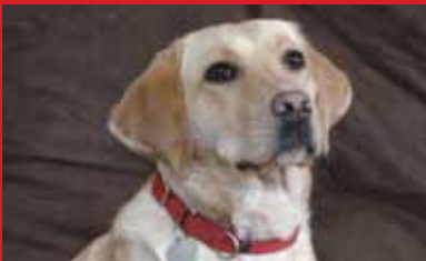
Kyle and Tally pg 11