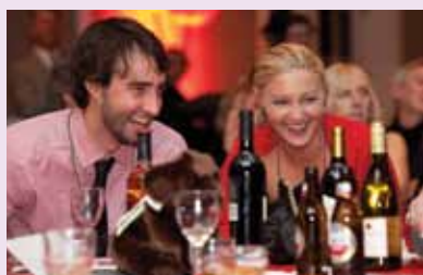
Big winners at the wine toss game

Nineteen program graduates, 32 assistance dogs and puppies in training, puppy raisers, a variety of Can Do friends and volunteers made a total of over 380 attendees!