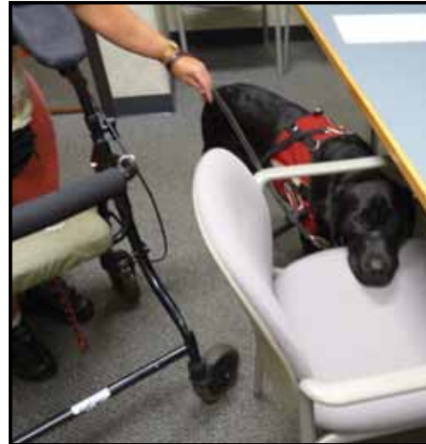
Bentley finds a chair