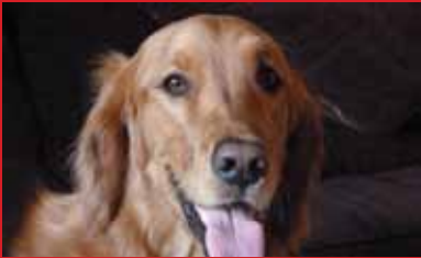
Emilie and Coach pg 5