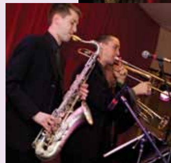
Music by Big Toe and the Jam